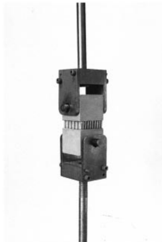
FIG. 1 Flatwise Tension Test Setup

7.2 Loading Fixtures —The loading fixtures shall be self-aligning and shall not apply eccentric loads. A satisfactory type of apparatus is shown in Fig. 1. The loading blocks shall be